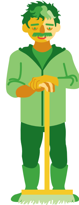
Colin Coalbucket The church caretaker