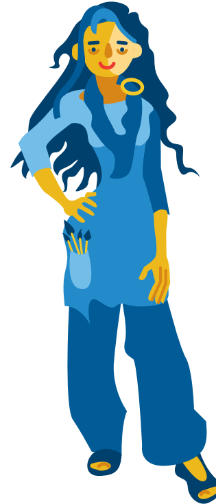
Amelia Artypants Organiser of all Messy activities